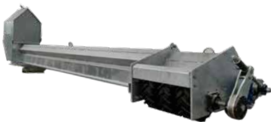
— Photo of FSA050 sweep auger