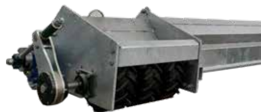
— Photo of FSA050 3 tractor end wheels