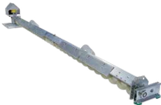
— Photo of CST sweep auger