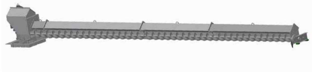
— Dwg of CST sweep auger