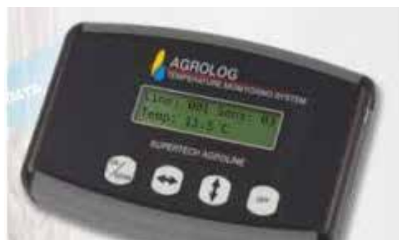
— Photo TMS2500 hand terminal