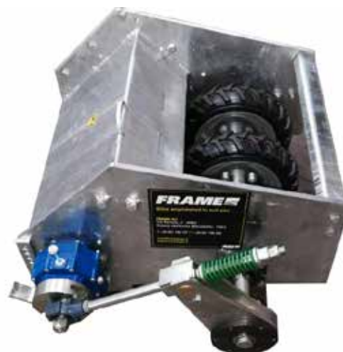
— Photo of FSA 100 3 wheel gear motor