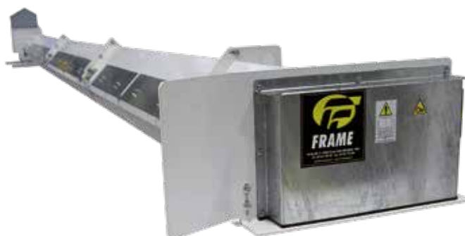
— Photo of FSA 100 sweep auger