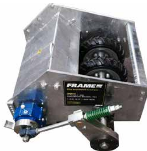
— Photo of FSA050 3 wheel gear motor