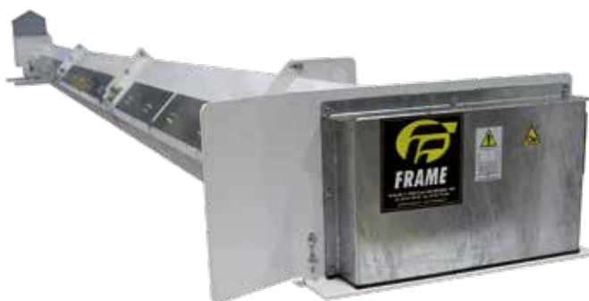
— Photo of FSA050 sweep auger